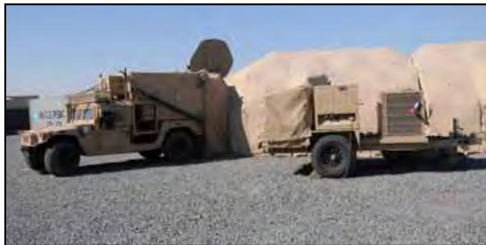
The Assault Command Post consists of a small slice of Third Army's necessary staff consisting of four vehicles and less than 40 personnel that can all fit easily inside a C-17. This allows the ACP to deploy faster and with less support than the larger Contingency Command Post and provide more flexible command and control to anywhere in Third Army's area of responsibility.